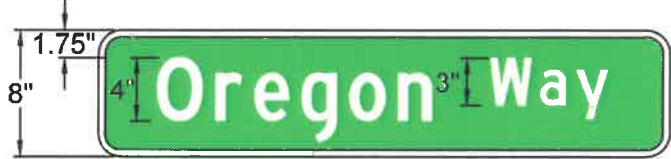
WITH DESCENDING LETTERS