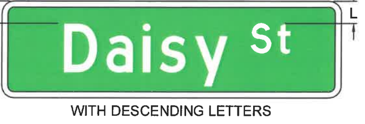
WITH DESCENDING LETTERS