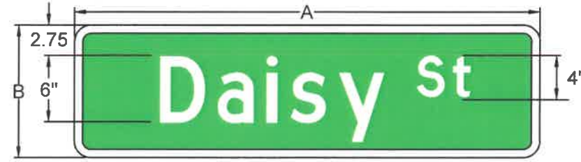
WITH DESCENDING LETTERS