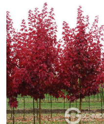
Urban Sunset Maple