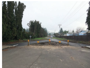
Connection at S. 54th St.