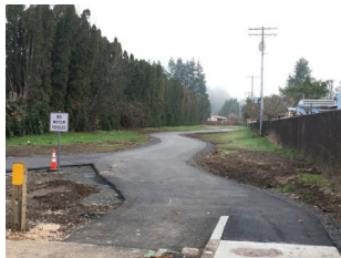
Connection at S. 54th St.

The S. 54th Street multi-use path is nearing completion! The City completed the design work in late summer. Then the City's Operations Division built the path this past fall. Below are pictures of the path work.